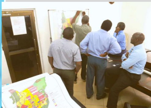
Joint planning session of water supply and sanitation services for Morogoro Town

Standard financial report is important in order to give reasonable assurance of organisation's financial position to the auditors, regulator, investors, government and banks on the accuracy and completeness of financial statements. ATAWAS is hosting Financial Management workshop on IPSAS with specific focus to the water sector. The course will be facilitated by experienced and accredited trainers from NBAA. For more information contact info@atawas.or.tz